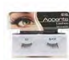
ARD61301 301 Black

Accent Lashes are half the size of traditional strip lashes that will enhance your look not create a new one. They are also shorter and designed to be applied on the outer corners of the eyes for an Audrey Hepburn look. This shorter length is perfect for a natural look and fool-proof application and can be worn for every occasion from formals to just a night out.