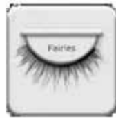
ARD65026 Fairies Black