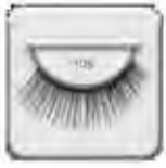
ARD65002 105 Black

Our eyes are without a doubt the first feature a person notice. Ardell Fashion Lashes allows you to create the sexy lashes you've always wanted with a minimal effort. Fashion lashes instantly make your eyes appear bigger and help dress up your look for any occasion. With over 20 styles ranging from demure and pretty to fab wild, these 100% sterilized human hair false lashes offer a natural look day after day.