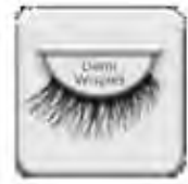
ARD65012 Demi Wispies Black