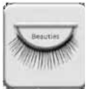
ARD65014 Demi Pixies