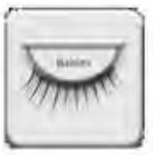
ARD65031 Babies Black