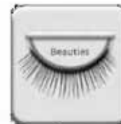
ARD65017 Scanties Black