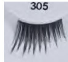
ARD61305 305 Black