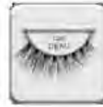
ARD65092 120 Black Demi