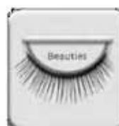
ARD65030 Luckies Black