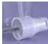
9071 White Pump for 2 oz bottles