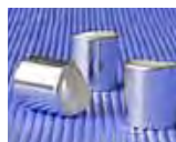
9055 Metal Disc Top Cap, Fits 2 oz/4 oz Bottles