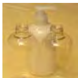
853114 Clear Boston Round Bottle 8 oz/240 ml