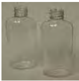
9017 Clear Cosmo Oval Bottle 2 oz/60 ml

PET Plastic is most popular for spas and retail. PET offers a smooth, pliable yet durable finish. It is the most commonly accepted plastic for recycling and accepted by most programs.