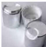
9008 Metal Disc Top Cap, Fits 8 oz Bottle