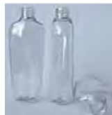
9002 Clear Naples Bottle 4 oz/120 ml