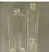
9014 Clear Cosmo Oval Bottle 8 oz/240 ml