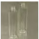
9015 Clear Bullet Bottle 8 oz/240 ml